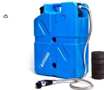
Hanging shower jerrycan @ 50 USD