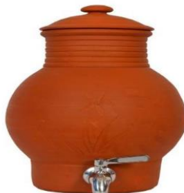
Handy flow pot @ 32 USD