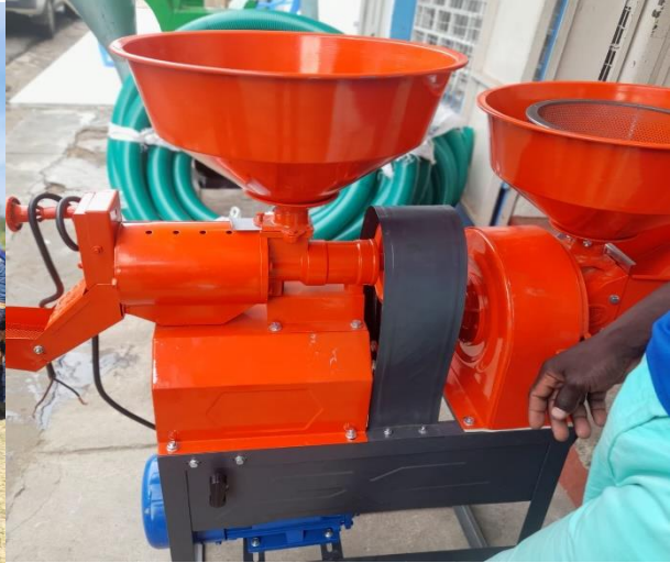
Posho mill for rice and vegetables