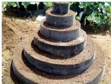
A corn garden @ 47 USD

As part of our commitment to our elderly members and their grandchildren , we plan to install 30 water handy flow pots and 30 hanging shower jerrycans . To put up a gazebo training hall, 2 permanent classrooms for the children and install 40 corn gardens for the elderly to enhance food security.